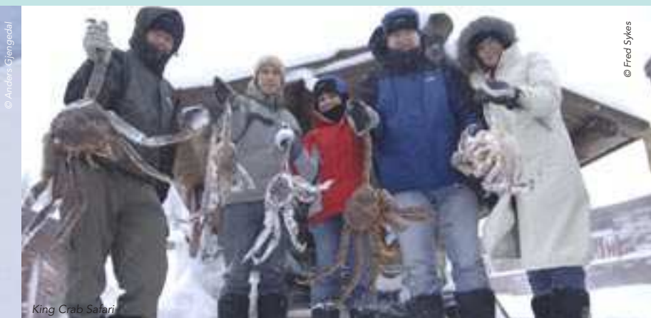
King Crab Safari