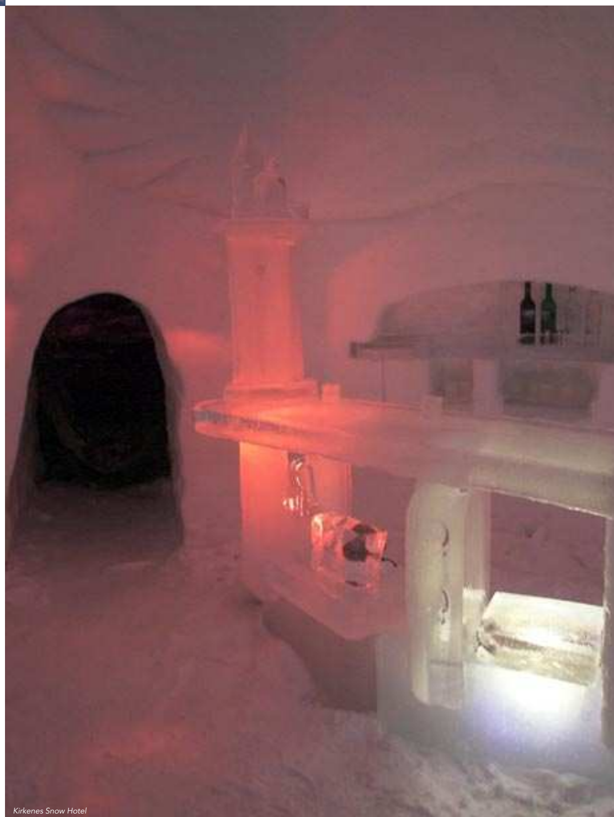
Kirkenes Snow Hotel

See more of these fantastic trips and excursions on our DVD. Call us for your free copy.