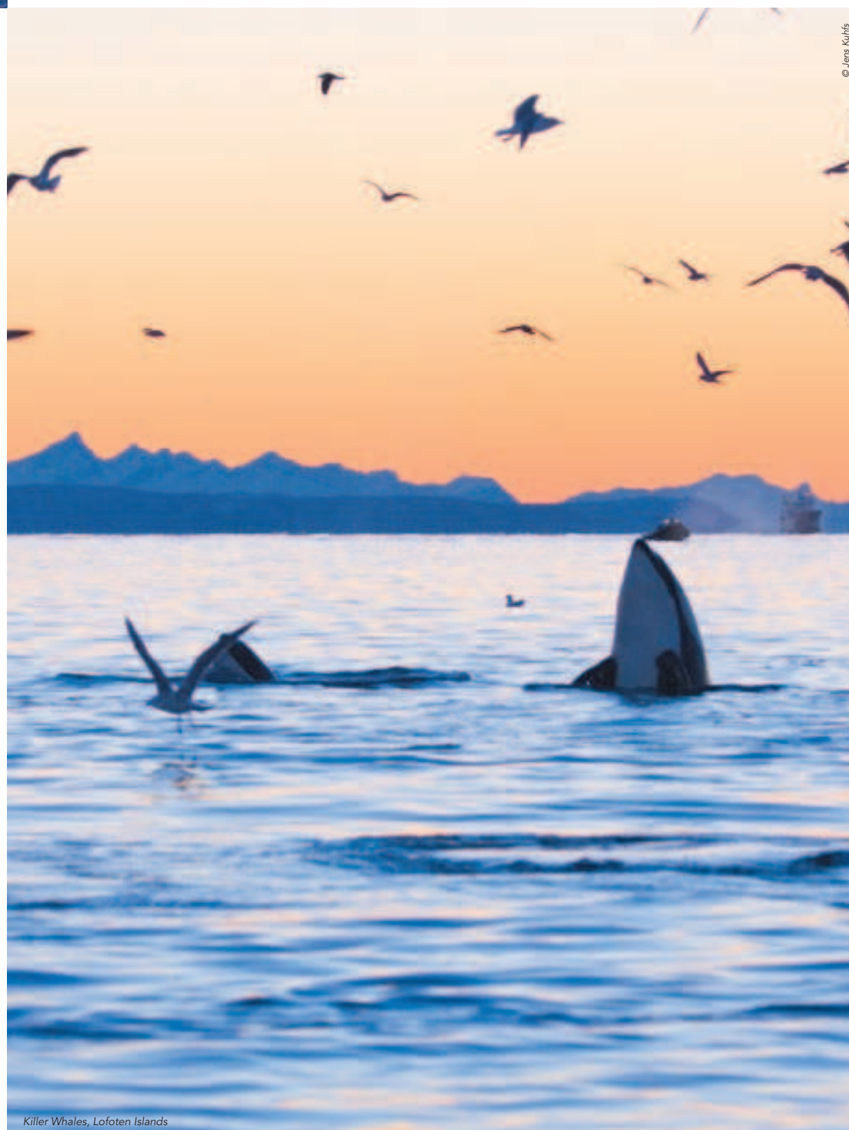
Killer Whales, Lofoten Islands

These highly sociable mammals live in groups or pods and since 1986 they have come to feed on the large population of spring herring that spend the winter in Tysfjord.