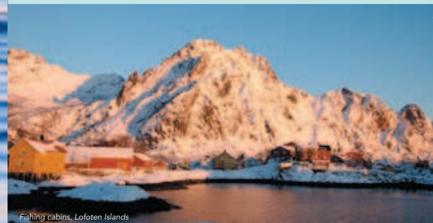
Fishing cabins, Lofoten Islands