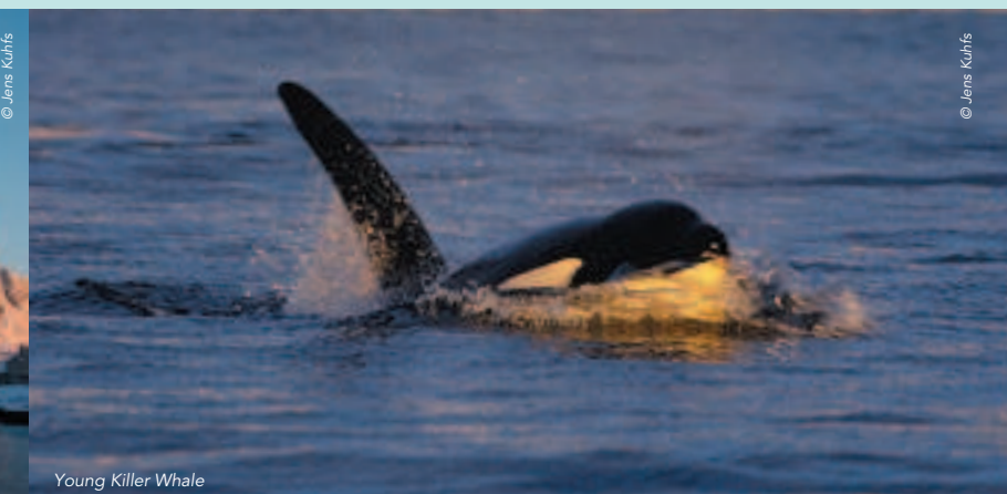
Young Killer Whale