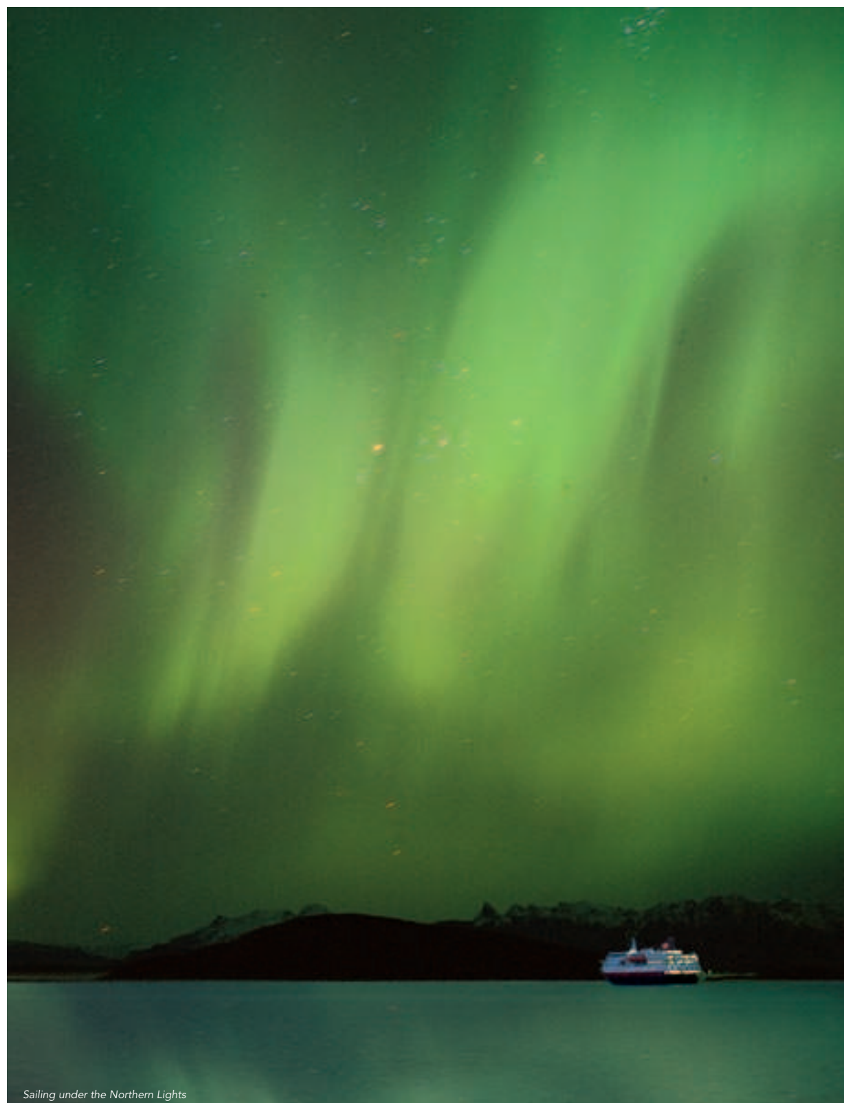
Sailing under the Northern Lights

Full tour information is outlined on the following pages – you may select which journey you wish to take, based on what best suits your time, budget and expectations.